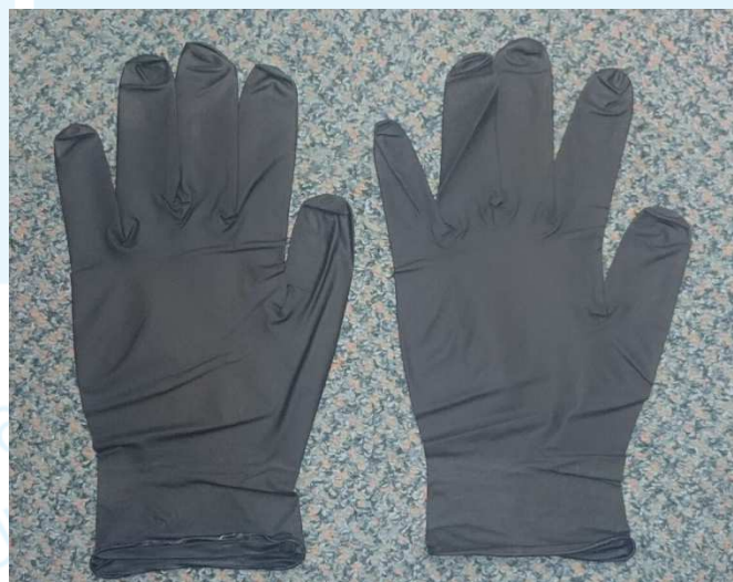
6112PFM from lot #60610252